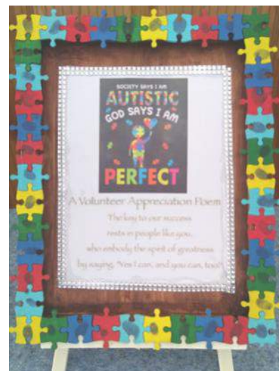
Each puzzle piece has one of the student's Finger Prints. It is currently on the Welcome Center

presented this student framed certificate to our congregation to say, “Thank you” for your support of our school!”